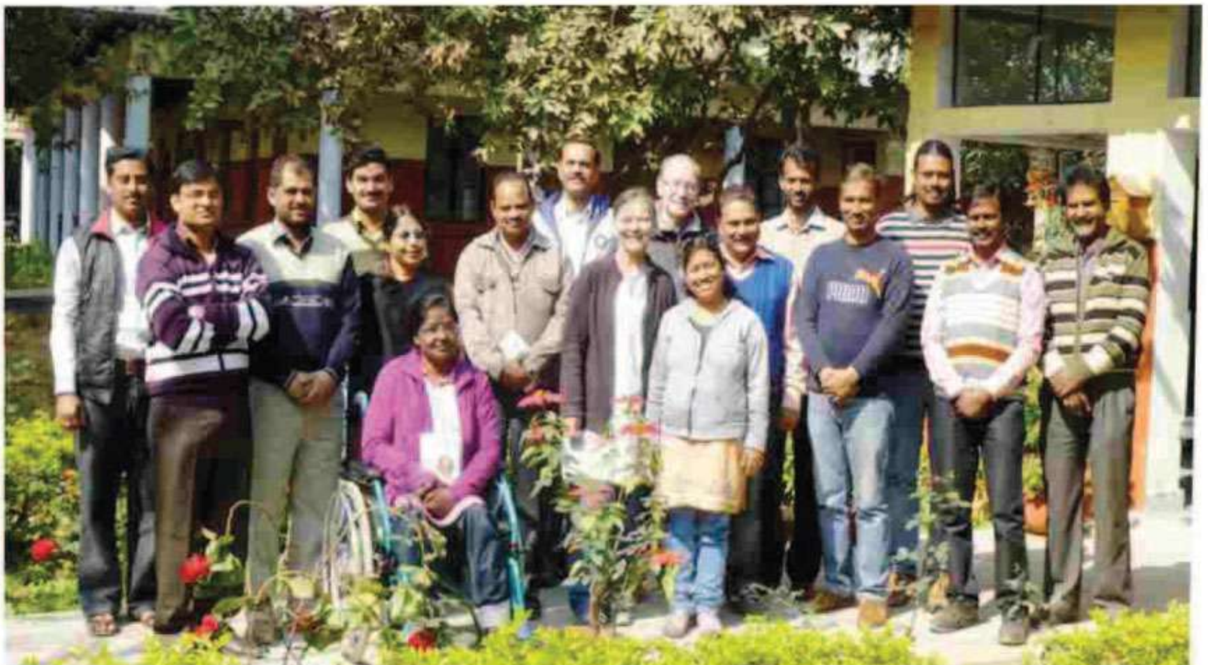
KIRAN'S Extended Management Team