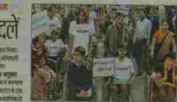
विकलांगता एक अलग ही पहचान है। इसे समझने और स्वीकार करने की जरूरत है। हमें इन लोगों को अपने साथ ही देखना चाहिए।