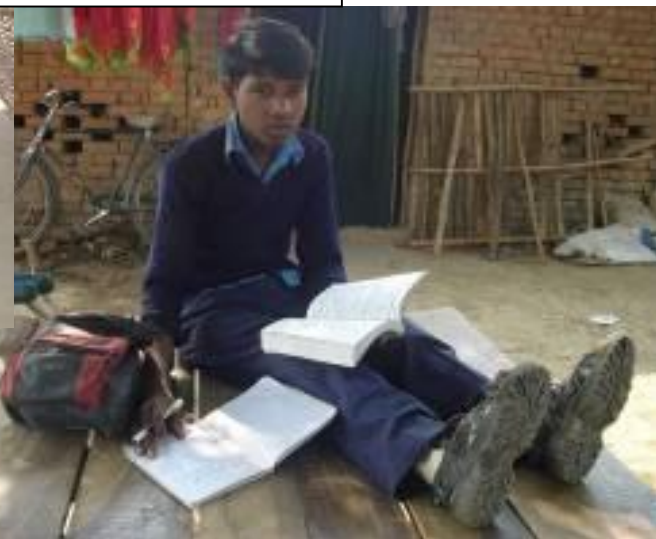
Once again he started his education.