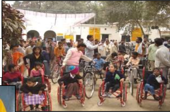
Wheelchairs and tricycle distribution camp