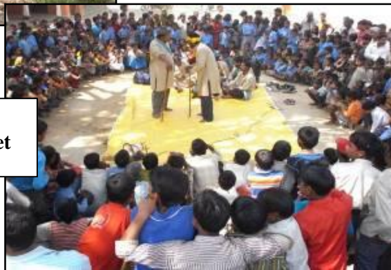
Public awareness through Street Play in the village