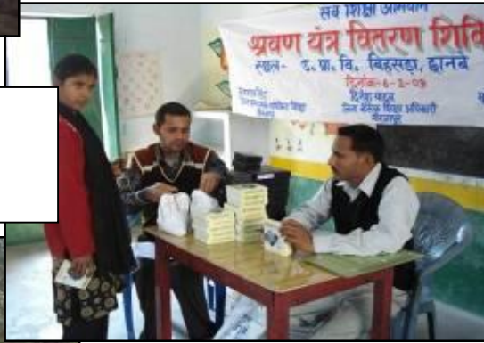
Hearing aids distribution camp for hearing impaired children