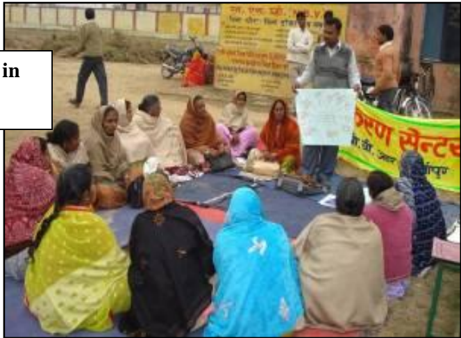
Training of Health workers in the village