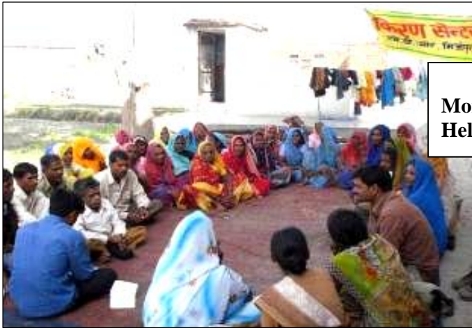
Monthly meeting in one of the Self Help Group