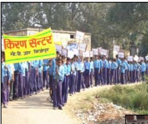
This is an awareness rally conducted with schools in Mirzapur about health and education.