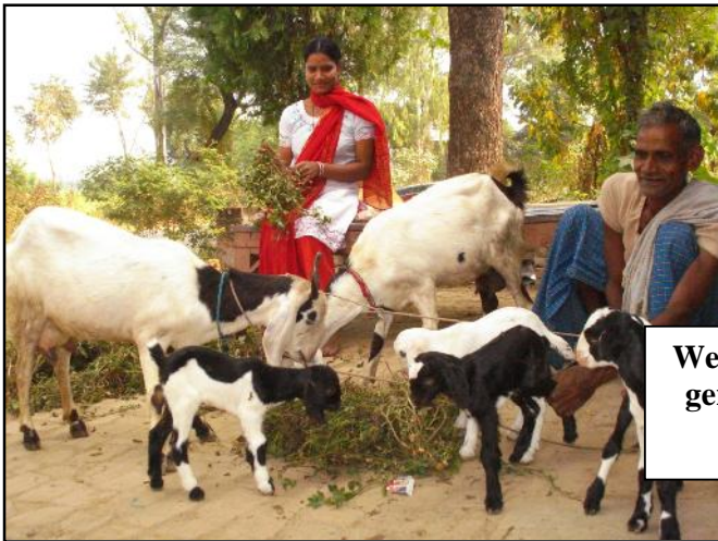
We support and guide various Income generation programs through Micro Credits.